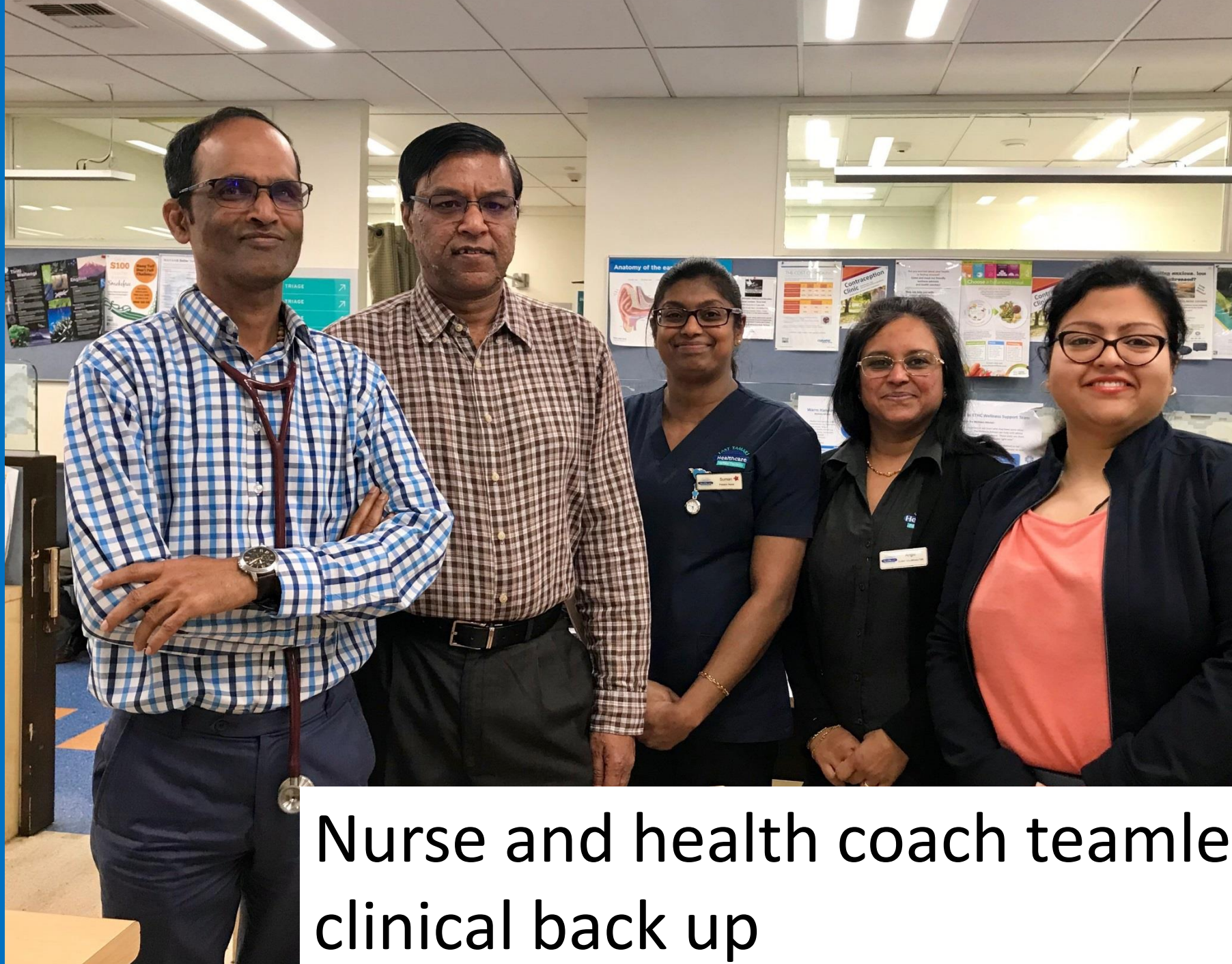
Nurse and health coach teamlet with clinical back up